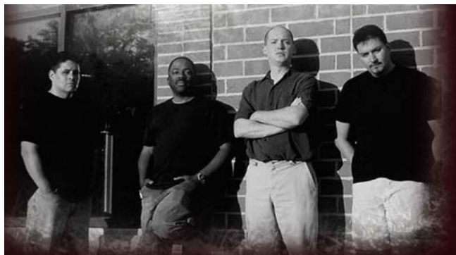
Sound of Reign

All veterans of church worship teams, the members of Sound of Reign joined forces to combine their skilled musicianship and passion for worship. The result is a positive, worship infused, adult alternative sound.