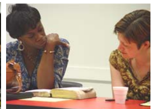
A couple of seminar attendees