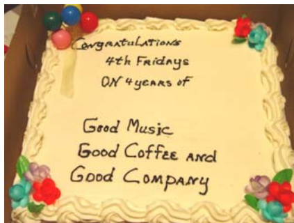
4F Birthday Cake by the Cake Lady