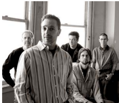
Looking Up

Looking Up is a Christian Rock band in South Eastern Michigan. They are a full-service ministry dedicated to spreading the saving knowledge of Jesus Christ through music. Although they are a rock band, their music is very diverse and includes praise and worship as well as thought provoking ballads.