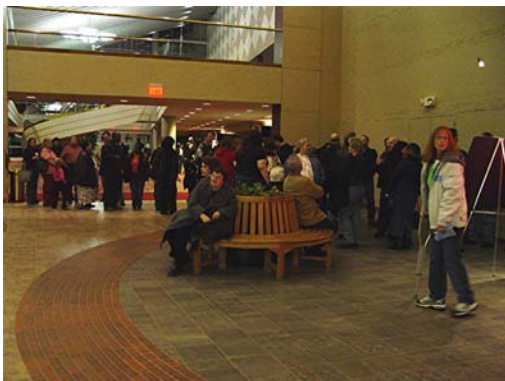
March 4F Crowd